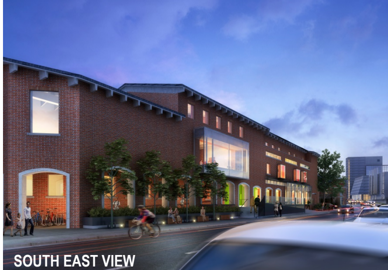
SOUTH EAST VIEW