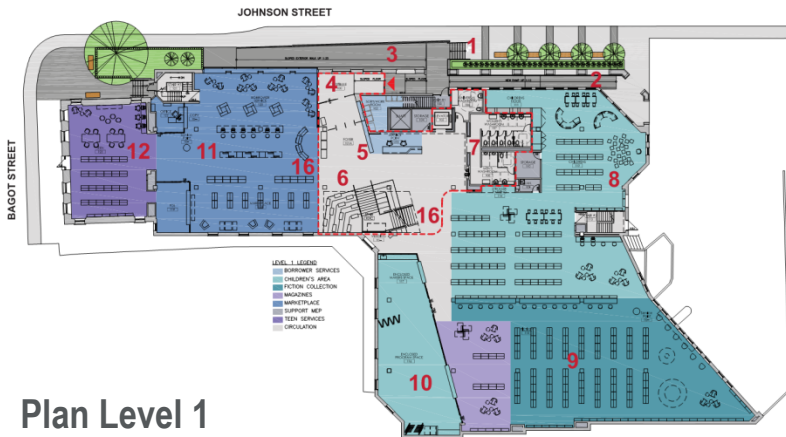
Plan Level 1