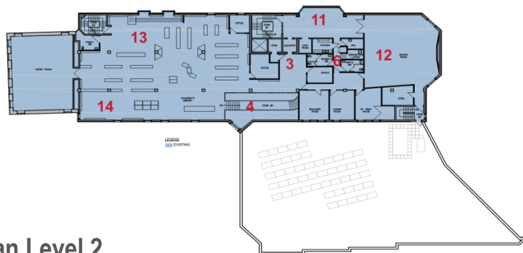
Plan Level 2