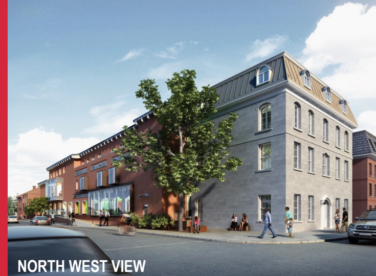
NORTH WEST VIEW