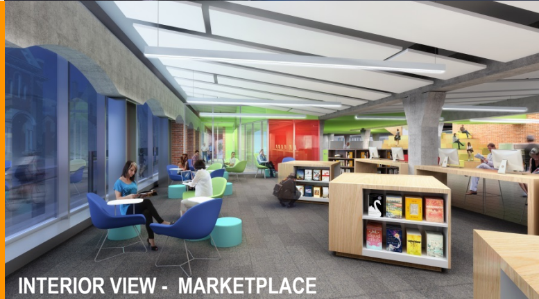
INTERIOR VIEW - MARKETPLACE